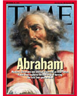
September 30, 2002 Vol. 160 No. 14